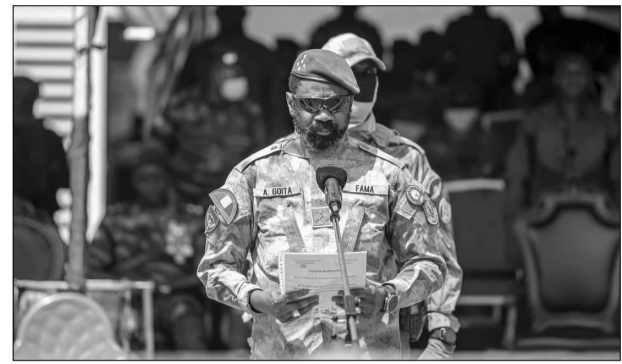
U nongialam ka Mali uba la shimti kum u Myntri iada ri.

Bamako, Jymmang: U nongialam ka Mali bad president ka ri u la shimti ia ka kam kum u Myntri iada ri, ong ki bor synshar ha ka sngi Nyngkong ba la lah hadien ba u nongmihkhat ba mynta u la shah pyniap na ka jingshah thombor ba shyrkhei da ki kynhun lehnoh jihadi kiba iatreilang kaba la pynkyndit ia kane ka ri West Africa.