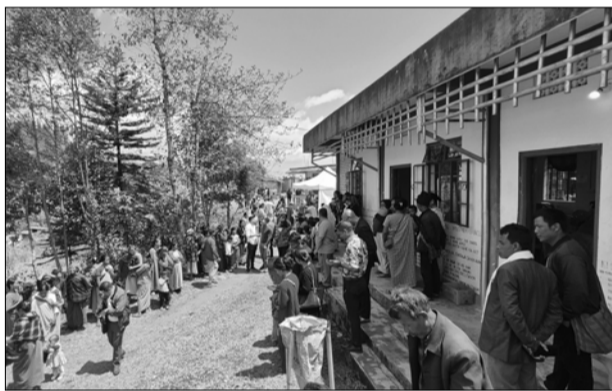
Ki paidbah ba shim bynta ha ka Awareness Programme.