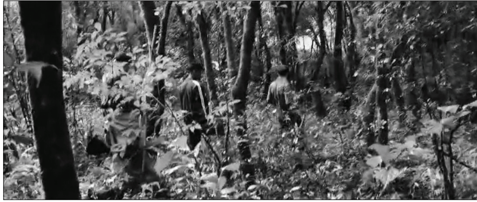
Ki jaka ba ki paidbah jong ka shnong Jakrem ki la pyrshang ban wad ia ka longkmie ba la jah.