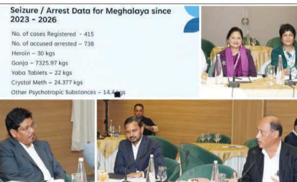
Seizure / Arrest Data for Meghalaya since 2023 - 2026 No. of cases Registered - 415 No. of accused arrested - 738 Heroin - 30 kgs Ganja - 7325.97 kgs Vaba Tablets - 22 kgs Crystal Meth - 24.377 kgs Other Psychotropic Substances - 14.4 kgs

Shillong, Jymmang 16 : U Myntri Rangbah ka Jylla Conrad K Sangma ha ka sngi Saitjain u la lum ia ka jingialang buddien bad ki ophisar haba iadei bad ka jingpyntreikam ia ki projek iakhun drok kaba tip kum ka Drug Reduction, Elimination, and Action Mission (DREAM) ha State Guest House, Taraghar. Ha kane ka jingialang, u Myntri Rangbah u la banjur ia ka jingdonkam ban don ka jingiatrei lang kaba jan bad