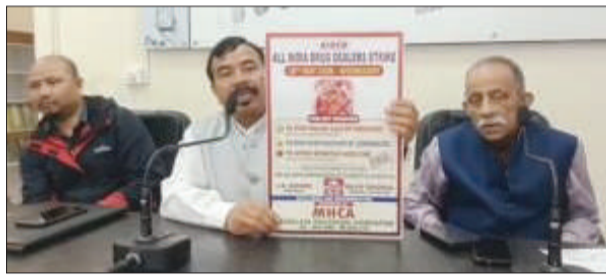
U President ka MHCA.