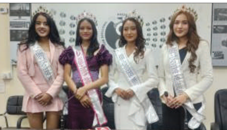
Ki samla iakob thei bhabriew.