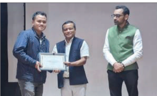
U Myntri ka SAD ba aiti syrnot.

Shillong, Jymmang 16: Ka jinghikai ia ki samla kiba la ioh rung ha ka kam Lower Division Assistants (LDA) hapoh ka Secretariat Administration Department, ka sorkar jylla, kaba la long ar taiew lynter la pynkut noh ha kine ki sngi ha kaba 85 ngut kiba la shah hikai kyrpang shuwa ban kin sdang trei ia ka kam, ia kane ka jinghikai la pynlong ha Meghalaya Ad-