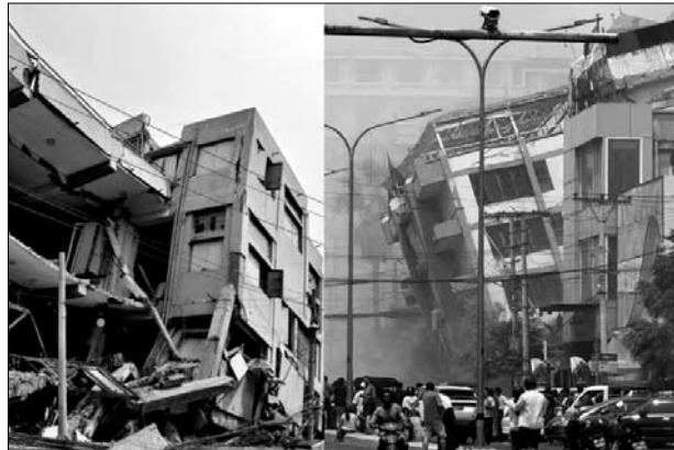
Ki iing ki sem bun mala kiba la twa bad khyllem hadien u jumai ba jur ha Thailand bad Myanmar.

Bangkok, Lber: U jumai ba jur uba don ia ka bor khyññih kaba kot 7.7 magnitud u la pynkhyññih tyngeh hynne ka por shiteng sngi jong ka sngi Thohdieng ia ka thain shatei sepgni ka sorbah Sagaing ka Myanmar bad ki bynta ba marjan ka Thailand ha kaba la ngeit ba ka jingiap jong ki brieve ka lah ban kynjoh sha ka palat spah ngut namar ka jingkhyllem jong kiba bun ki iing ki sem kiba bun mala ha kylleng ki jaka.