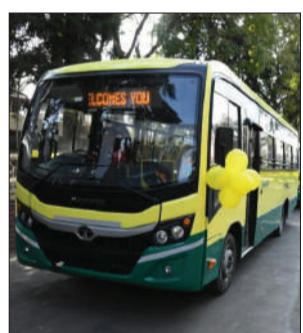
Shillong, Rymphang, 20: Ka jingdawa ka la nang kiew ban leit shaw bad leit on skul ia ki khynnah da ki bos sorkar ba la tip kum ki Sustainable Transport and Efficient Mobility Society (STEMS), da ka thong ban pynduna ia ka jingdheng kali ha nongbah Shillong.