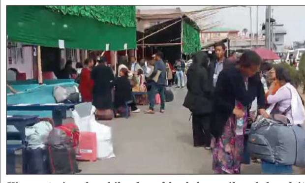
Ki nongtrei sorkar kiba dang khreh ban mih noh ban leit sha la ki jong ki Poling Station.