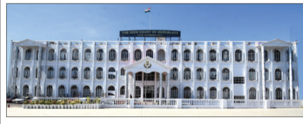
Shillong, Rymphang, 20: Ka Iingbishar Meghalaya High Court ha ka sngi Palei ka la bthah ia ka Trial Court

ban iaid shakmat ha kaba iadei bad ka jingshim jubab na ki nongai sakhi ha ka bamsap thungkam